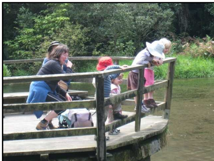
Watching ducks by the lake