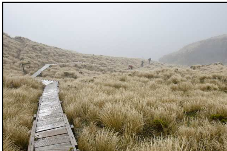
The long retreat from Syme to the carpark.